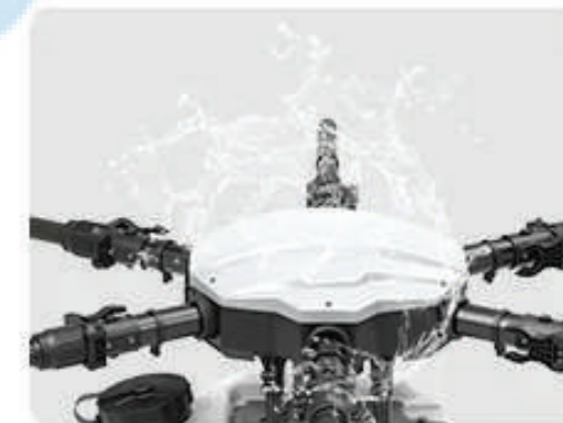
Fully Waterproof Body