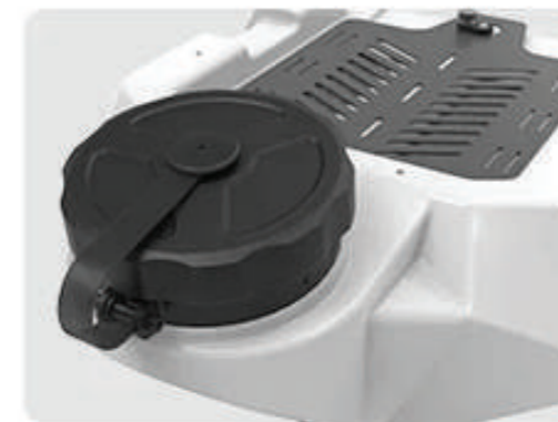
Enlarging The Tank Inlet