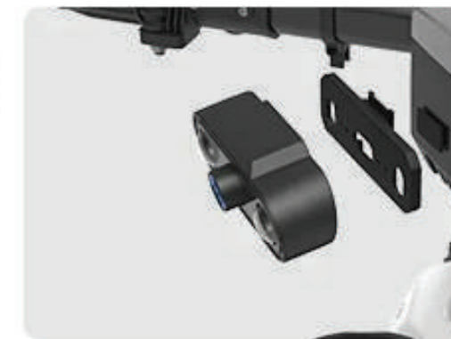
Detachable Camera Mount